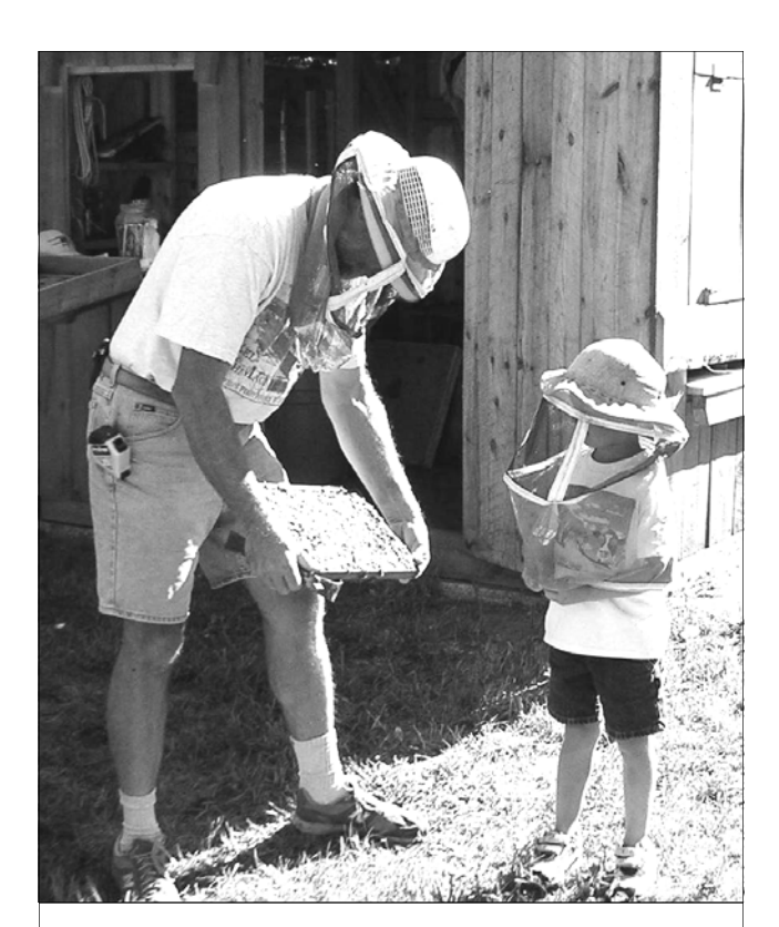
Will there be a next generation of beekeeper?

I look forward to seeing you at the ISBA Fall Meeting at the Illinois Department of Agriculture on November 18, 2006.β